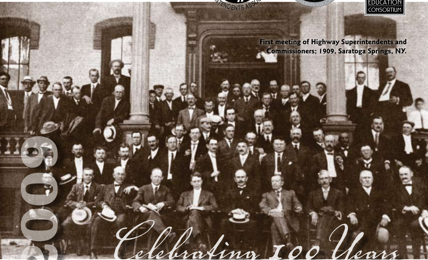
First meeting of Highway Superintendents and Commissioners; 1909, Saratoga Springs, NY.